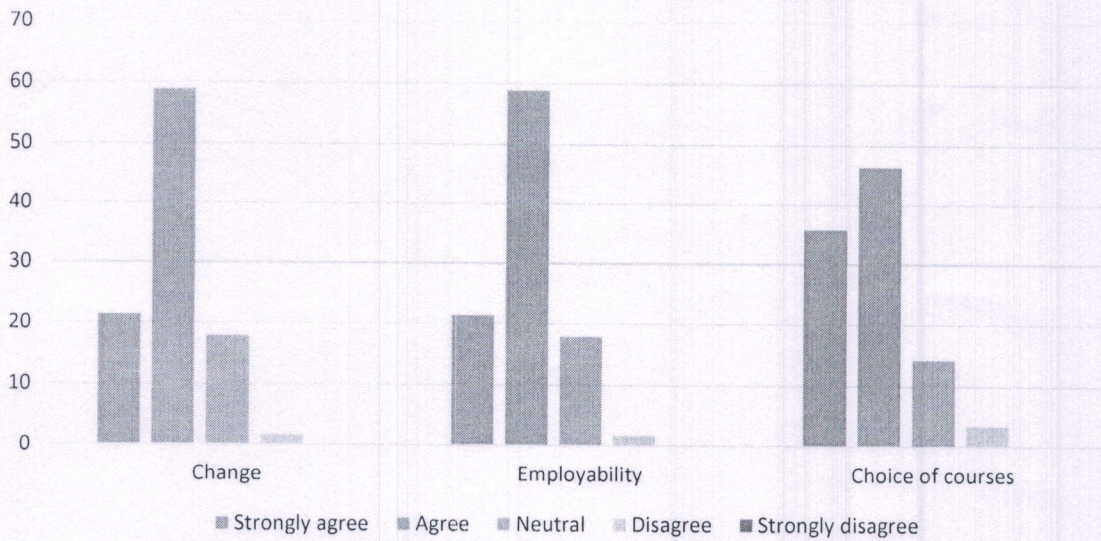
Parents feedback for the academic year 2020-2021